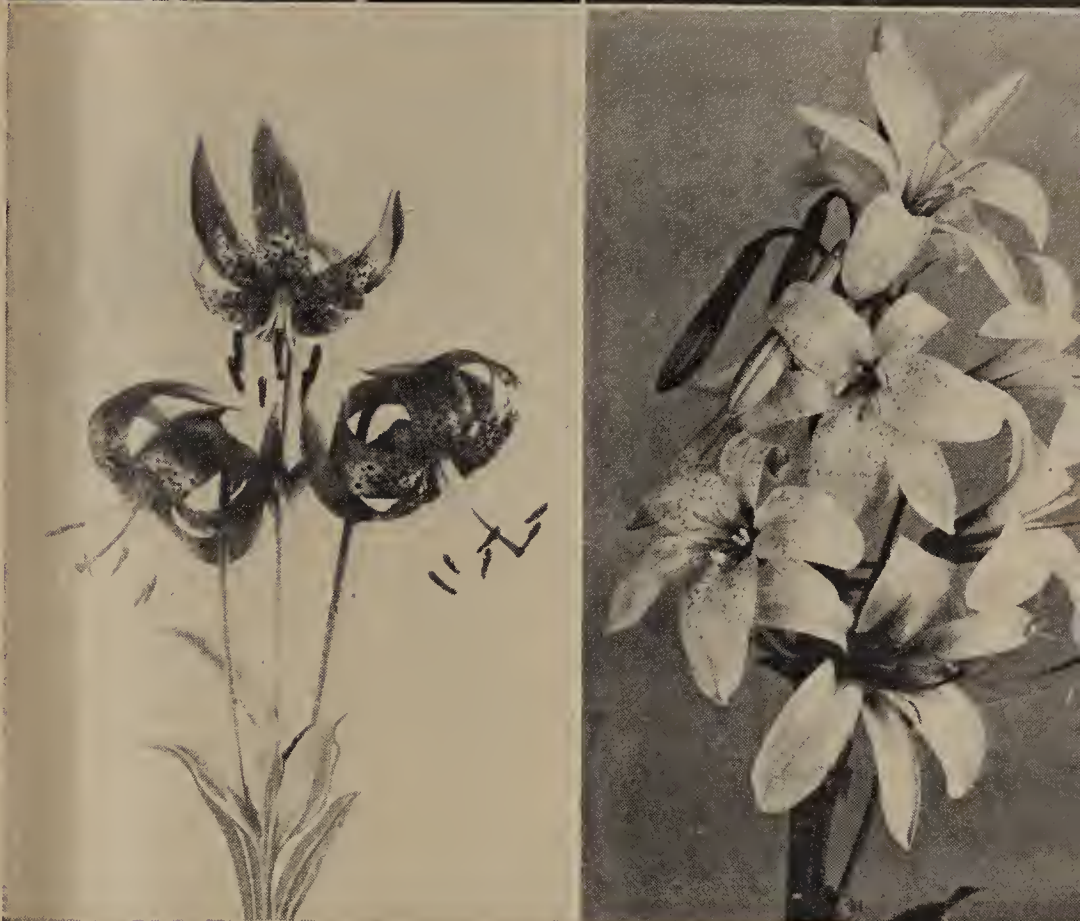
L. Kelloggii. L. Bolanderii. L. Pardalinum Giganteum.